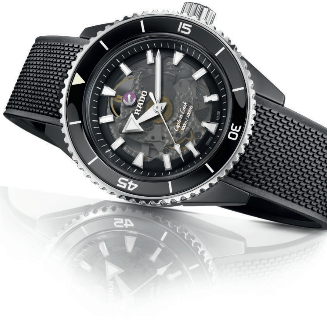
R32127156 Captain Cook High-Tech Ceramic Ø 43mm