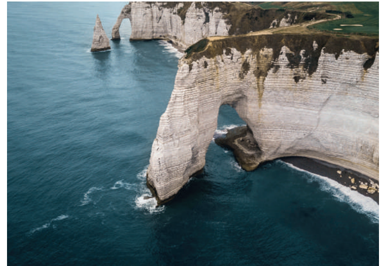
Étretat, Côte d'Albâtre, Normandy, France

Lidewij Edelkoort is one of the world's most famous trend forecasters. With Trend Union, her Paris-based company with offices in New York and Tokyo, Edelkoort creates trend books two or more years in advance that are used by strategists and designers at international brands. In 2015 Lidewij Edelkoort was named Dean of Hybrid Design Studies at the New School's Parsons School of Design in New York, where she in parallel initiated the very first New York Textile Month.